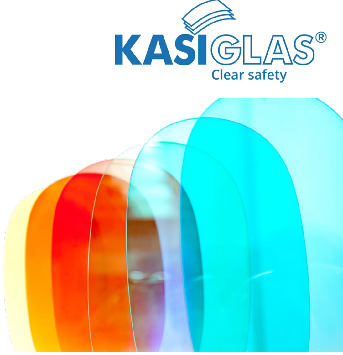
KASIGLAS® Colour pallette

As experts in transparent plastics, KRD Luftfahrttechnik GmbH's KASIGLAS® portfolio offers an ultra-robust material that has delivered safety in many industries for over 30 years while offering a variety of additional high-tech functions such as smart heating systems, anti-fogging, anti-glare wedges, switchable screens, and more. KRD Luftfahrttechnik GmbH's dedication is echoed in their credo, "We find solutions where others throw in the towel," which is the cornerstone of their commitment to not just being a material provider but a solution provider.